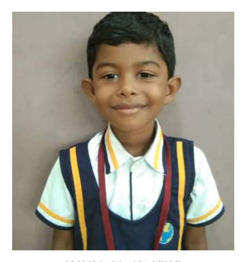
KAYAL V - K3 KIWI